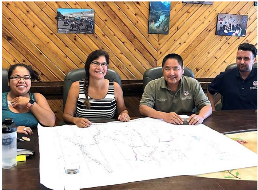
August 15, 2018 Wildfire Prevention Town Hall meeting, North Saanich – it was much appreciated!